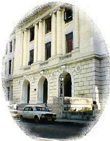
Frontis of the Physics Faculty, University of Havana